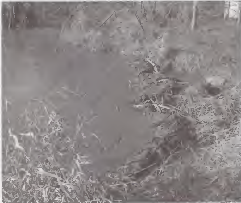
Beaver dam at the pond.

Most of us are familiar with the typical beaver lodge, a big cone-shaped pile of logs, branches and mud in the middle of a pond, or sometimes, close to shore. However, beaver will also create bank burrows when conditions do not permit construction of a lodge. Sometimes they will construct both lodges and burrows and use the two. "Our" beaver has created a burrow, identified by a pile of sticks forming what looks like a minute lodge against the bank, and smeared with mud. It may be that he began building a lodge but realized it was not feasible given the dearth of trees, and/or the lack of time. The entrance will be underwater, as is usual with both burrows and lodges.